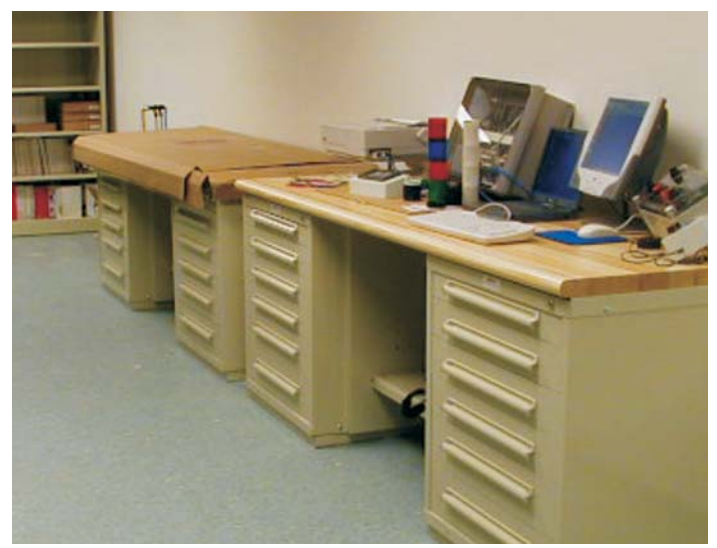
Modular Drawer Cabinet workcenters provide work and storage space in the communications department at the Orange County Fire Department in CA.

Equipto workcenters provide years of useful, rugged and efficient space utilization. Select from wall-mount or free-standing units, with or without drawers, and the largest variety of accessories to take advantage of your work space. Equipto's extensive line of workcenters organize work areas and productivity.