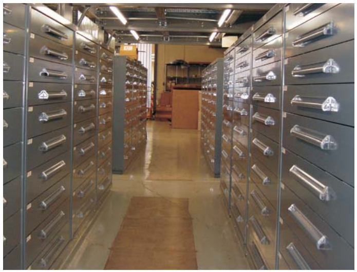
Modular Drawer Cabinets offer self-contained storage for small to medium parts and can be easily repositioned without unloading for facility reconfiguration or deployment.