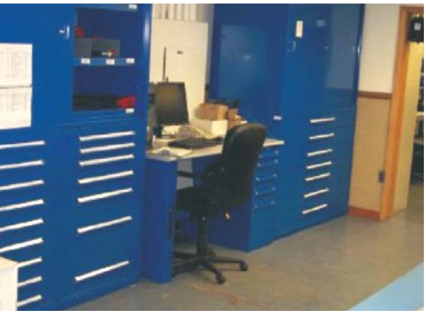
At Elmendorf AFB in Anchorage, AK, Modular Drawer Cabinets with upper shelving cabinets organize electronic parts and avionic components for the F-15 Boeing training facility.

Organize small avionic parts, maintenance tools and equipment, and department supplies with Modular Drawer Cabinets. Each Equipto Modular Drawer Cabinet is engineered and manufactured with exacting precision for years of rugged use. Mobility kits and a wide selection of worksurfaces create flexible, transportable custom work areas.