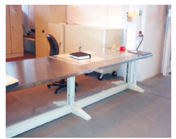
"Iron-I"" workcenters with stainless steel tops provide a clean, attractive work space for an avionics repair department at McChord AFB.