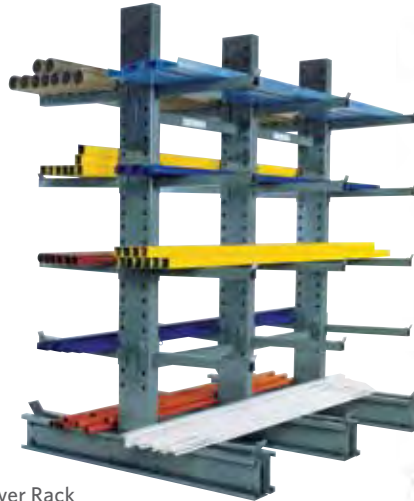
Steeltree® 08 Cantilever Rack Starter and Add-On units shown